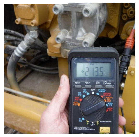
Pressure testing for hydraulics

This document is a sample and under the copyright of Mevas. Please contact us if you need a TA-2 or a TA-1-Plus anywhere in the world. Phone +4935206-39150 Website: <u>https://www.mevas.net</u>