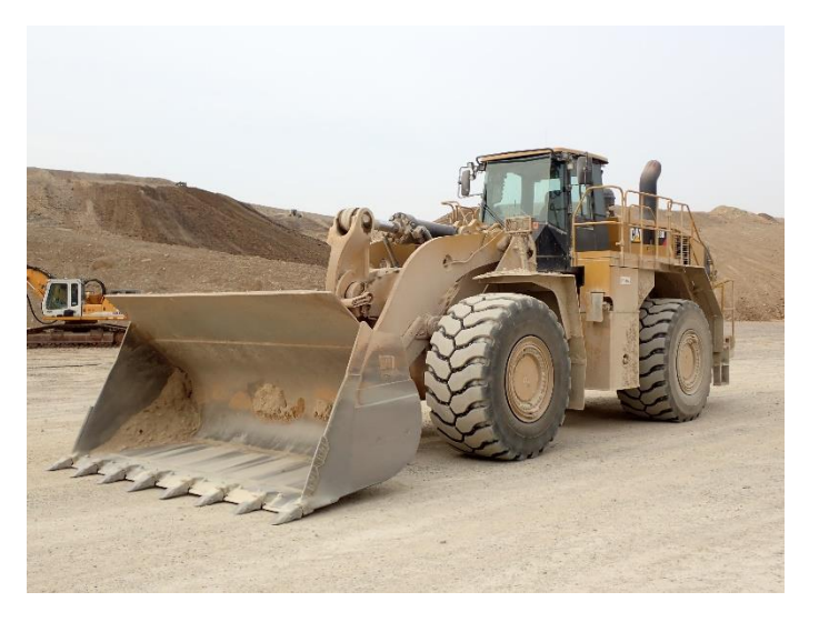
Caterpillar 988K Wheel Loader